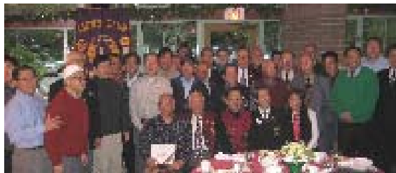
Vancouver Chinatown Lions Club (A1) Christmas luncheon & induction of 3 new members

SECOND HALF DUES FOR LCI & MD19 TO BE PAID BY MARCH 5 , 2008 IN ORDER TO KEEP YOUR CLUB IN A GOOD STANDING STATUS TO BE ELIGIBLE TO VOTE AT THE SPRING CONFERENCE