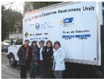
A-1 2nd Zone Meeting on January 27, 2008 & 2nd Cabinet Meeting on January 19, 2008 at the Vancouver East Lions Den