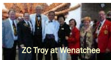
ZC Troy at Wenatchee