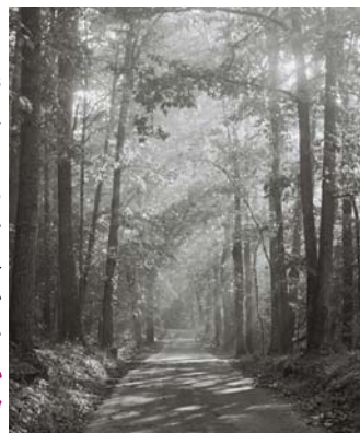
LCI 2007 Photo Contest "Best of show" category grand prize

Zone Chair Troy's MOTTO is "JOINING FORCES"